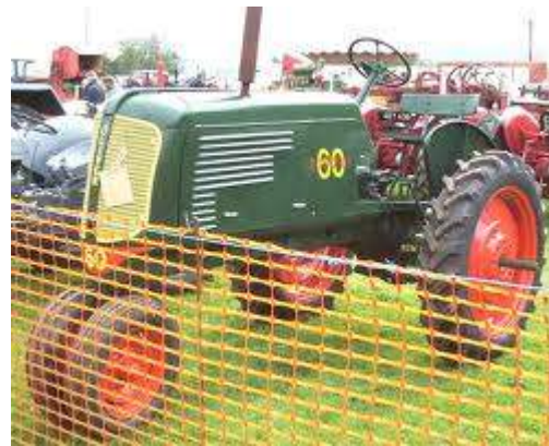
Row crop tractors