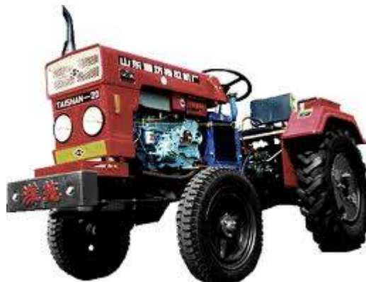
Four wheel tractor