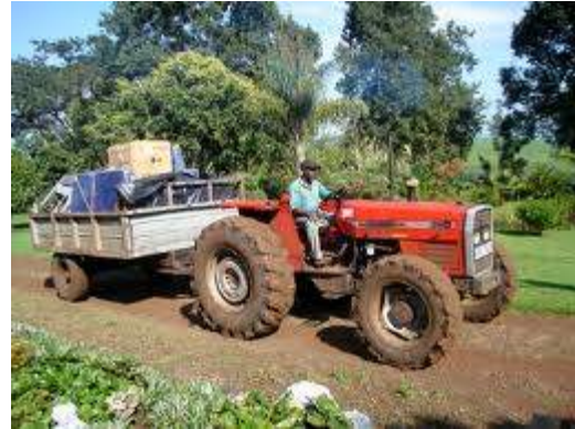
General purpose tractors