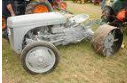
tractor for golf grounds