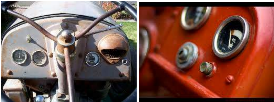
Tractor dash board

9. Water temperature gauge - this indicates the temperature of water of the cooling system