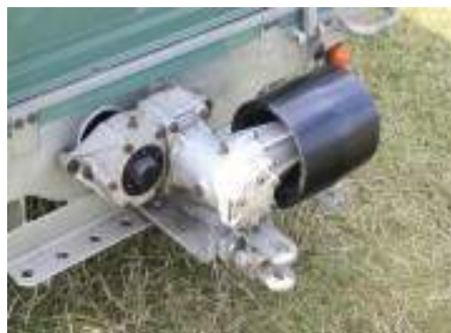
Belt pulley connected to tractor PTO

All tractors are provided with a belt pulley. The function of the pulley is to transmit power from the tractor to stationary machinery by means of a belt. It is used to operate thresher, centrifugal pump, silage cutter, and several other machinery. The pulley is located either on the left, right or rear side of the tractor. Pulley drive is engaged or disengaged from the engine by means of a clutch.